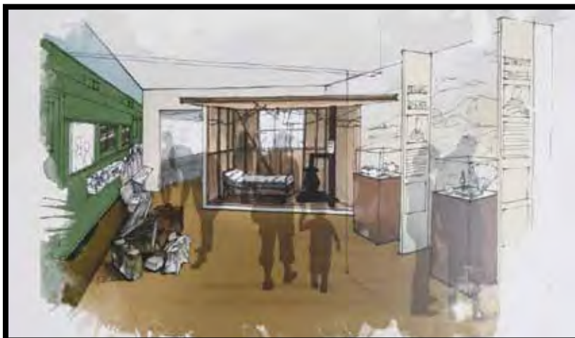
Artistic renderings of the new permanent exhibition by AldrichPears.