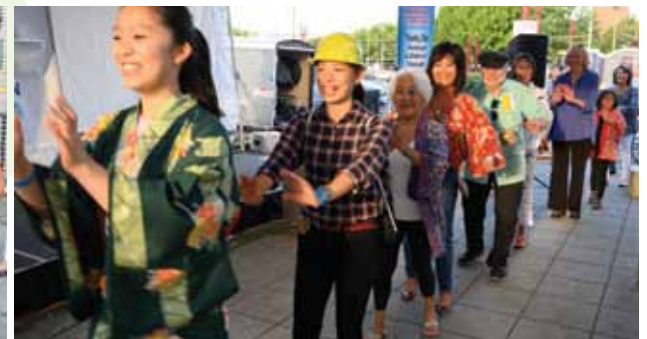
Clockwise from top • Board Members of Oregon Nikkei Endowment celebrate the reveal of the museum's new name and logo.